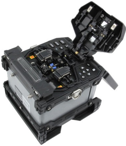
Large opening angle (Convenient splicing operation)