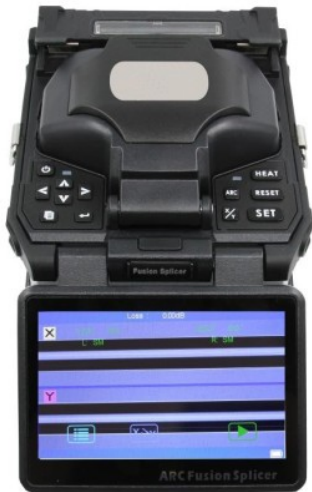
Fully automatic operation (6s fast splicing and 18s heating)