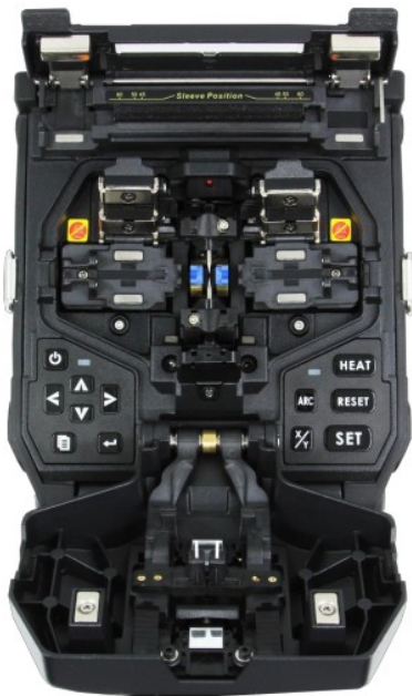
Multi in one metal precise fiber holder (0.25/0.9/2/3mm/drop cable)