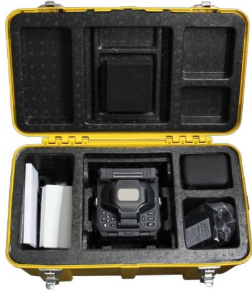
Large capacity carrying box (sturdy and durable)