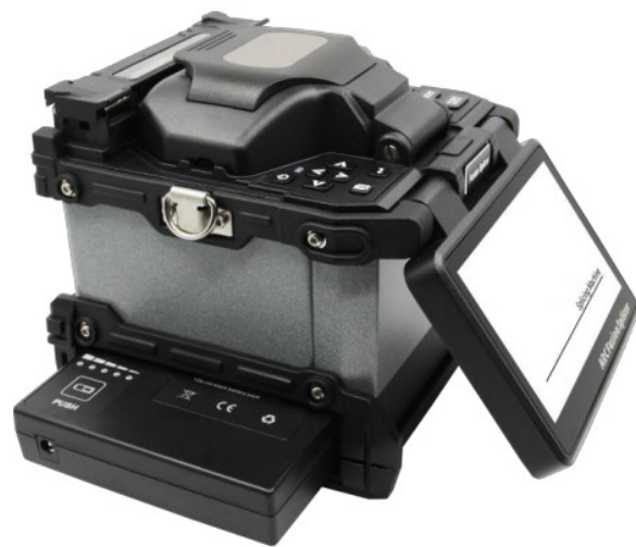
Detachable 5200mAh Li-battery (>250times splicing and heating cycle)