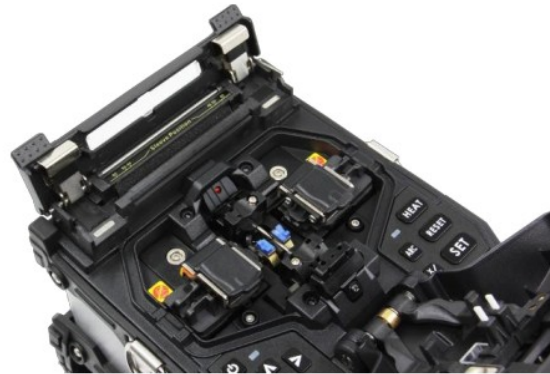
Inductive automatic heater (Heating time and temperature both adjustable)